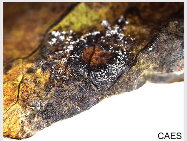
Pachysandra with leaf lesions (photo top). Sporulation on lower leaf surface (photo bottom).